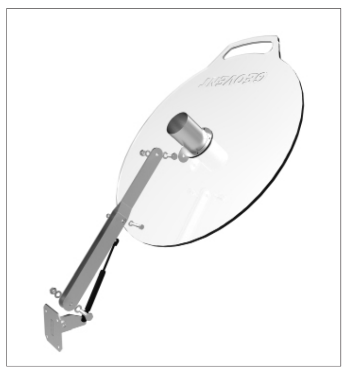
The lid is available in polycarbonate